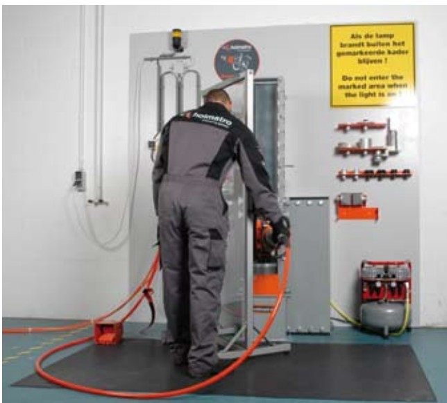
Testing hydraulic rescue equipment with the help of a test frame in a service workshop.