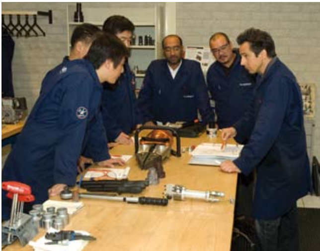
Holmatro dealers are required to participate in periodical service courses.